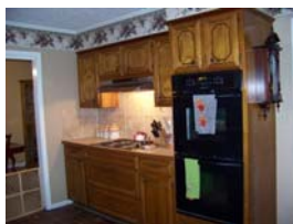
Kitchen (Double Oven)